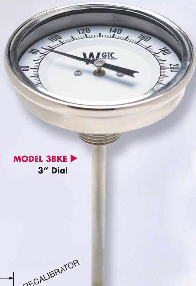
MODEL 3BKE ▶ 3" Dial